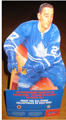
□ Frank Mahovlich 2003