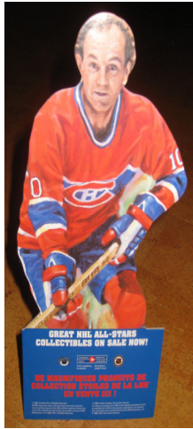
□ Guy Lafleur 2002